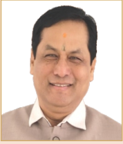
Shri Sarbananda Sonowal Hon'ble Union Minister of Ayush & Ports, Shipping and Waterways