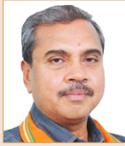
Dr. Munjpara Mahendrabhai Kalubhai Hon'ble Union Minister of State for Ayush and Women & Child Development